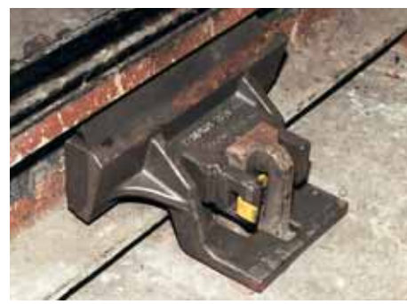
Cast-In PANDROL VANGUARD assembly installed on concrete slab track