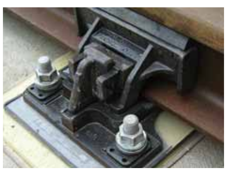
Baseplate VANGUARD assembly installed on concrete slab